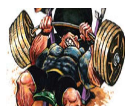
Sunday 2<sup>nd</sup> June DEADLIFT