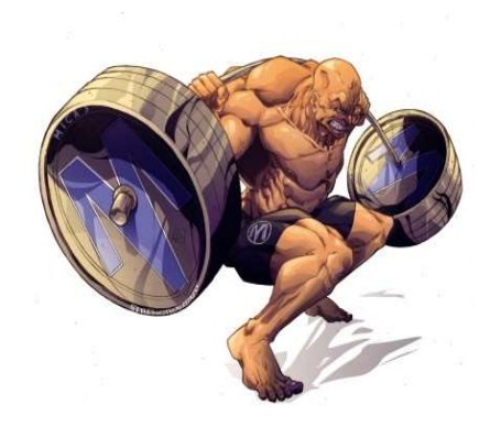
Saturday 1st June BENCH